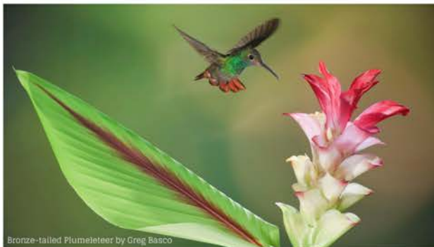
Bronze-tailed Plumeleteer by Greg Basco