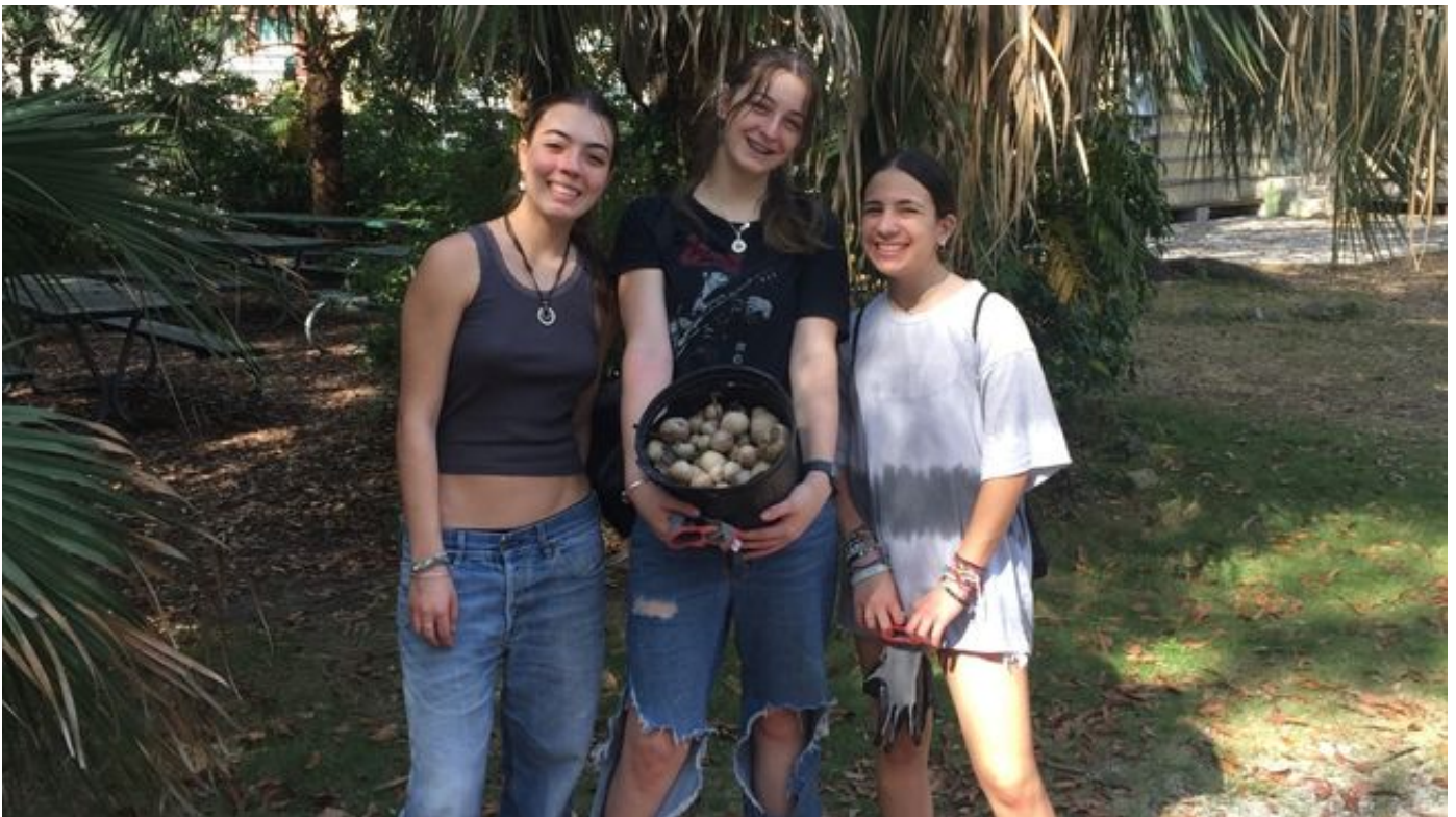
Photo: Volunteers joyfully display the bucket of invasive air potatoes they eradicated from our Steinberg Nature Center grounds!